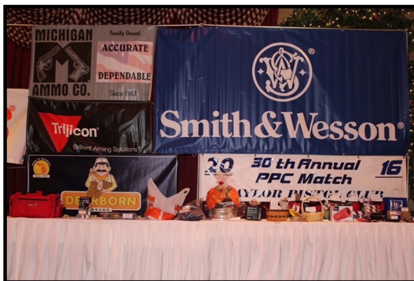
Sponsor's Banners displayed at our 2016 Match Banquet