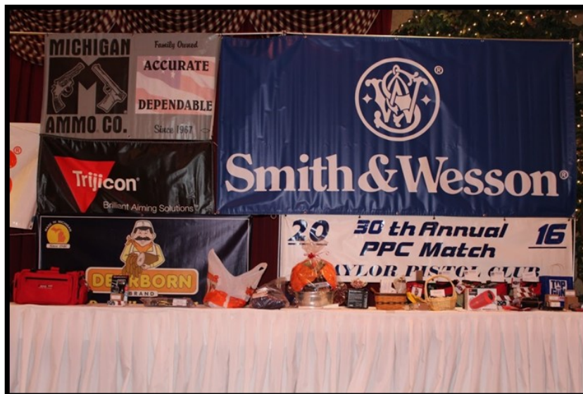
Sponsor's Banners displayed at our 2016 Match Banquet